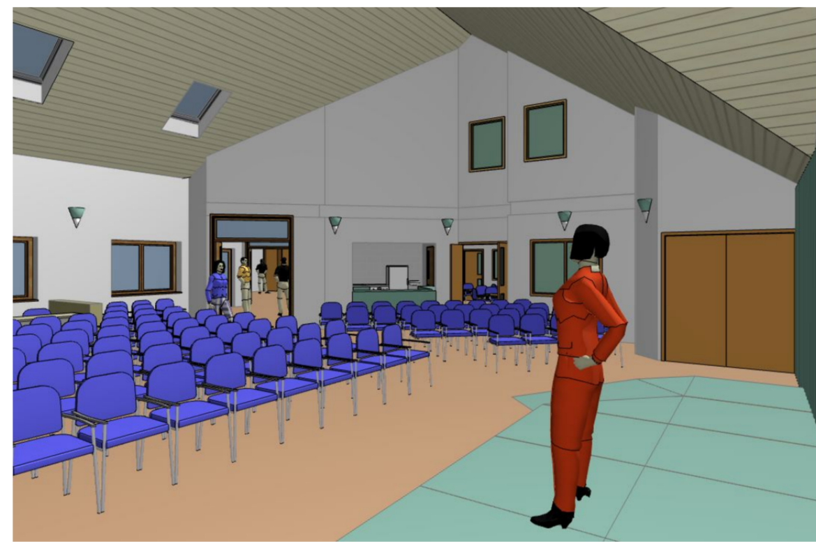
From Stage to Entrance 1:250