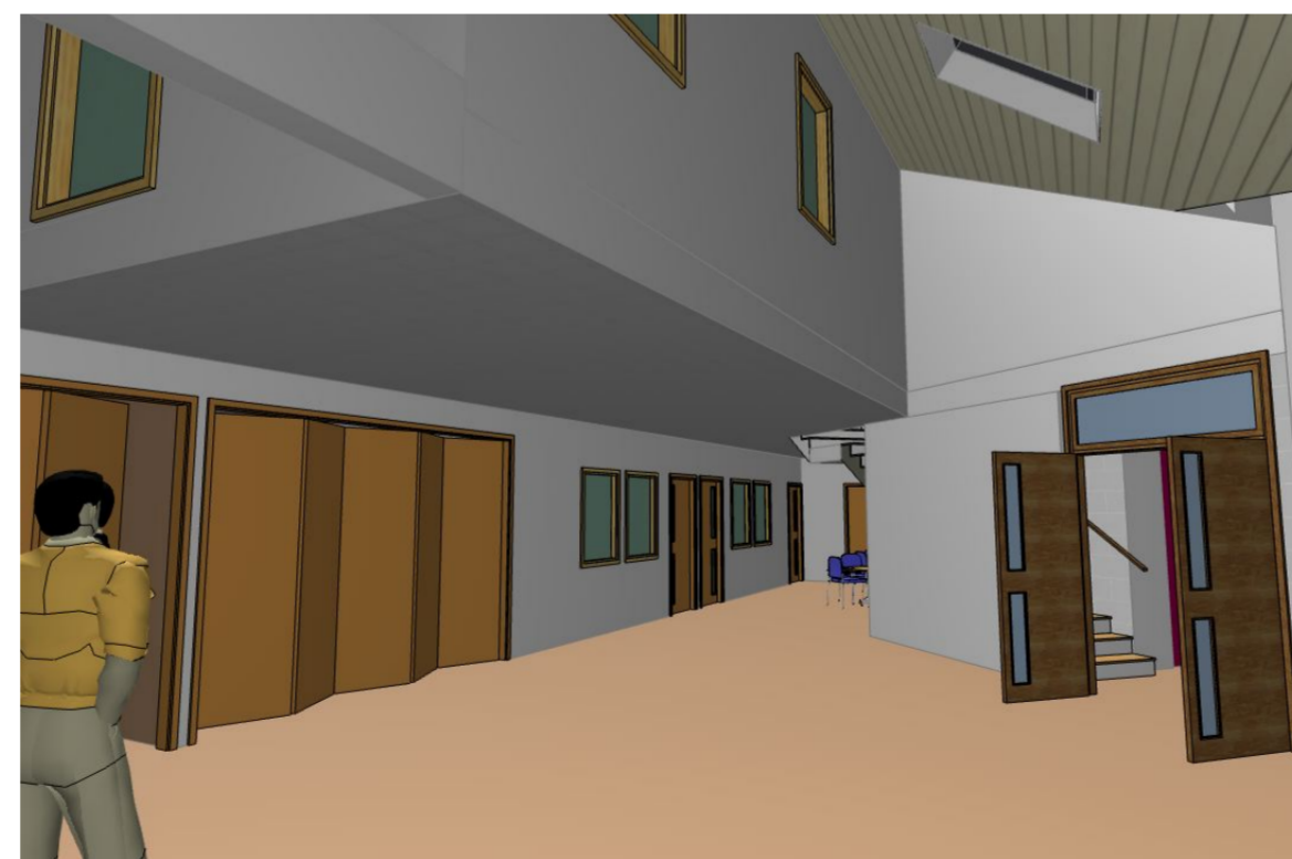
Hall Towards Entrance 1:250