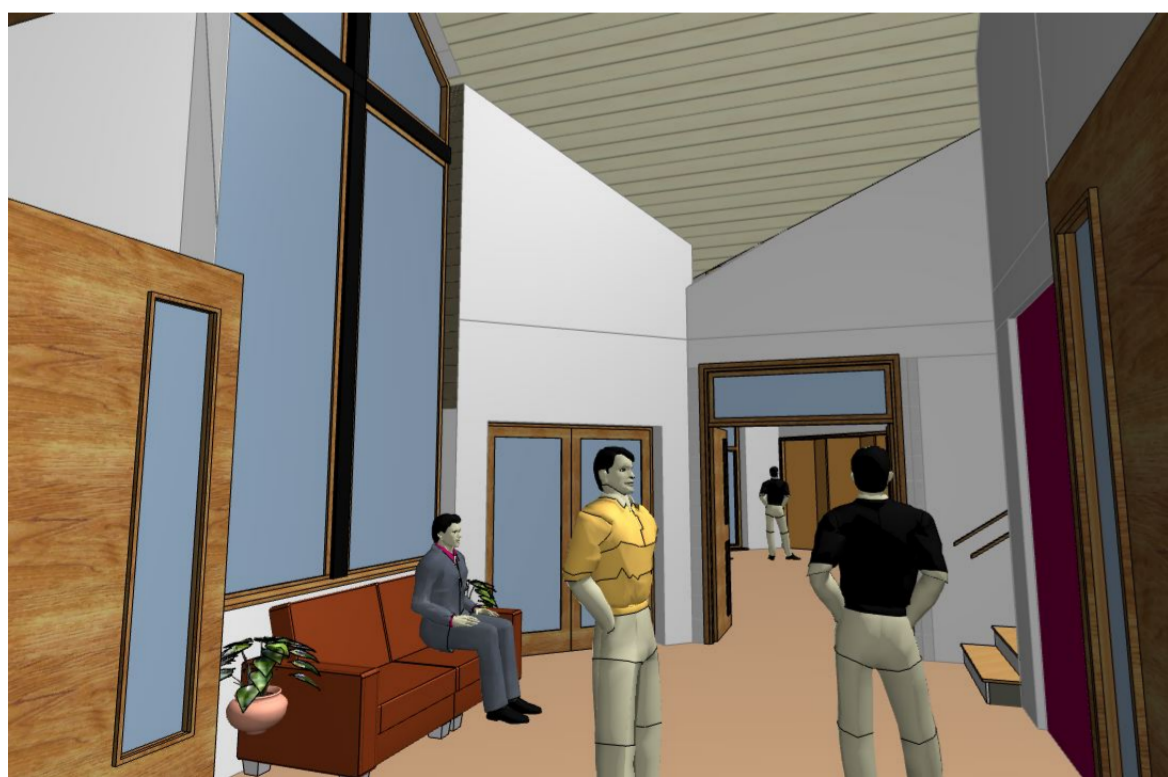
Entrance from Worship Area 1:250