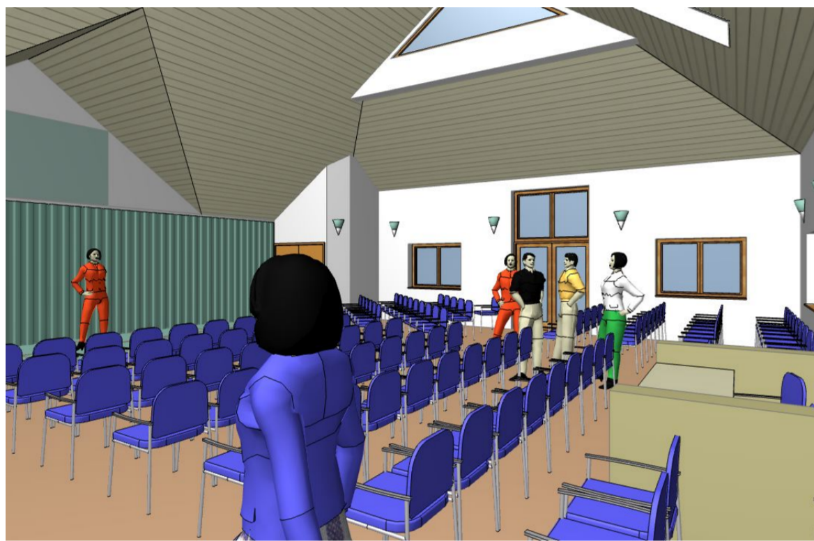
From Entrance to Worship Area 1:250