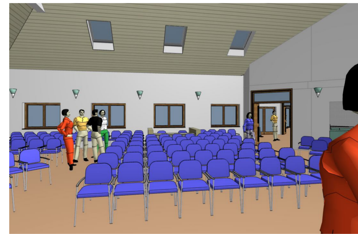
From Stage to Back of Wroship Area 1:250