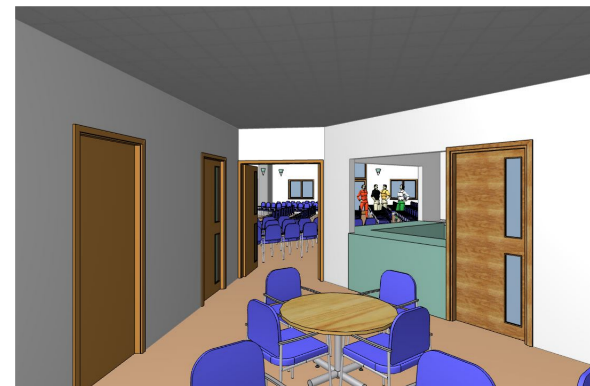
Cafe Towards Worship Area 1:250

REDESIGN ARCHITECTURE Junction Studios, 87 Uttongeter Old Road Derby DE1 1NG Tel : 01332 365099 e-mail : redesign@junctionstudios.co.uk web : www.redesignarchitecture.co.uk